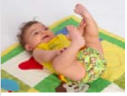
Babyville Diapers Credits: Babyville Boutique